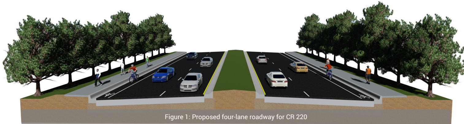
Figure 1: Proposed four-lane roadway for CR 220

The proposed project would widen CR 220 to a four-lane divided roadway (Refer to Figure 1). The proposed improvements would also add sidewalks and bicycle lanes to CR 220.