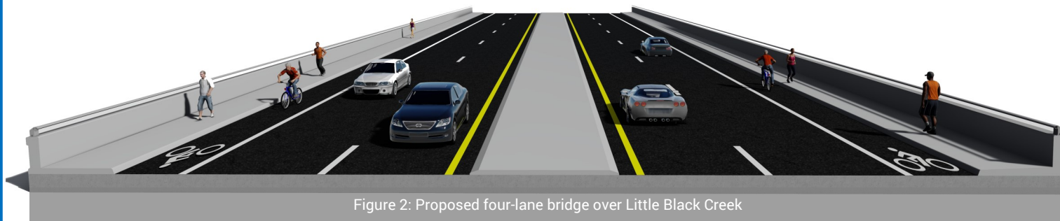
Figure 2: Proposed four-lane bridge over Little Black Creek

The proposed project would also widen the CR 220 bridge over Little Black Creek (Refer to Figure 2). Sidewalks and bicycle lanes would also be provided on the bridge.